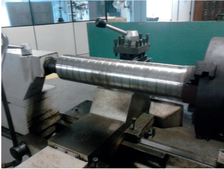
Figure 1. External cylindrical turning process.