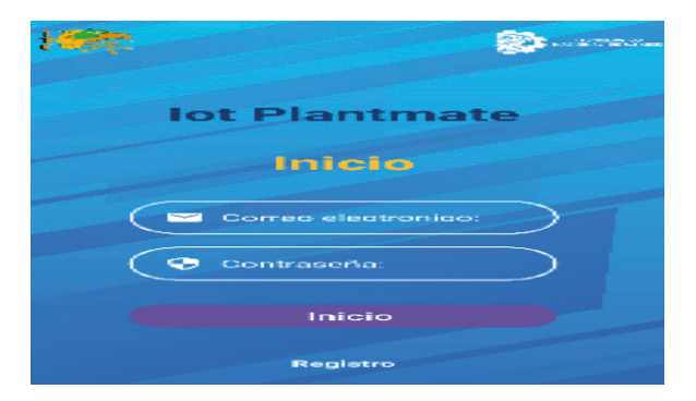
Illustration 4. Login screen.

The registration of users and administrators to access the mobile application is shown in Figure 5.