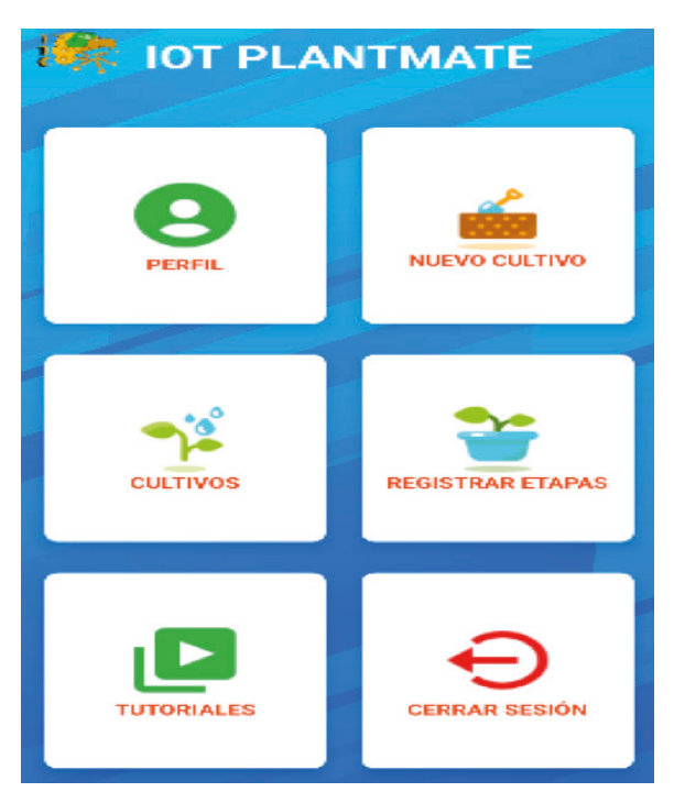
Illustration 6. Sections of the application.

Visual cards representing the different sections or functionalities of the app, such as profile, new crop, sensors, stage registration, tutorials and logout, to facilitate access to different areas of the application are presented in Figure 6.