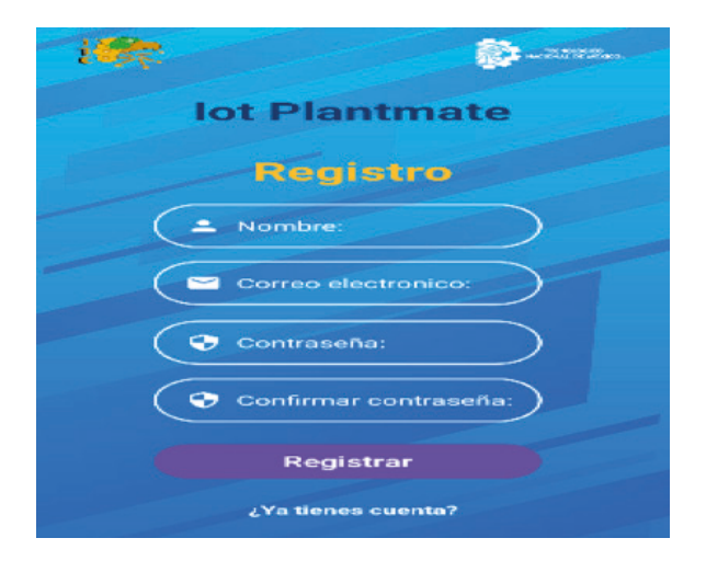
Figure 5. Registration to the mobile application.

The registration of users and administrators to access the mobile application is shown in Figure 5.