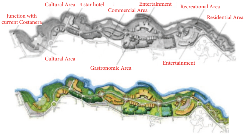
Figure 5. Lake San Roque Shoreline Project. Alternative project commissioning. Various sources.