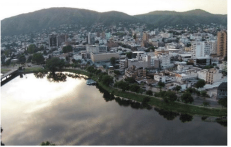
Figure 3. Progress of urbanization on the hillside and coast.

moso, Cosquín, Santa María de Punilla, Bialet Massé, Tanti, Villa Carlos Paz, La Calera, Villa Allende, Saldán, Córdoba.<sup>1</sup>