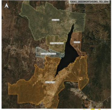
Figure 6: Municipalities that make up the edge of the San Roque Reservoir perilago.