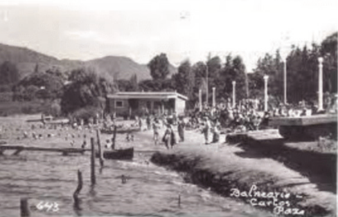
Figure 2. Photo of the VCP perilago spas.

In the same year, Provincial Decree No. 8178/69 fixed the 36 m. level line as the limit of the land subject to expropriation for the San Roque Dam reservoir, freeing those located above that line. The same Decree prohibits any building between elevations +35 to +36 (Art. 5). It indicates that the owners facing Lake San Roque must: a) Leave a 15 meter wide strip of green space from the 36 meter level curve. b) Refrain from dumping sewage or industrial liquids into the lake without prior purification treatment duly approved by the Provincial Hydraulic Directorate. All the works, subdivisions, constructions, improvements or modifications of the current altimetric plan characteristics, of the lands included between the curves of the 36 and 38 meters must be previously approved by the Provincial Directorate of Hydraulics. To this end, the General Directorate of Cadastre and the Professional Associations and the Municipality of Villa Carlos Paz, shall not proceed with any file related to the lands located between elevations +35 to +38 without the previous intervention and resolution of the Provincial Directorate of Hydraulics, which shall ensure the faithful compliance with these provisions. (Art. 7).