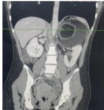
Figures 1 and 2: expansive formation in the topography of the left adrenal gland measuring 97x98mm, with well-defined limits, parietal calcifications, heterogeneous content and fat density inside, with no evidence of enhancement by contrast medium, the appearance being compatible with a fatty lineage lesion.