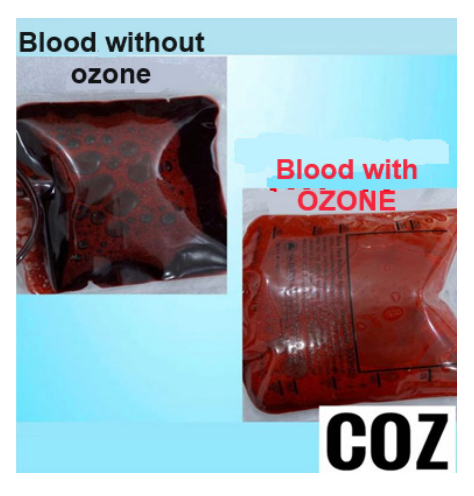
Figure 2 : Major ozonized autohemotherapy.