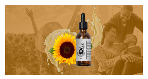
Figure 4 : Ozonized sunflower oil

Consists of local application with ozonized oils, promoting an antiseptic reaction, activating local circulation, accelerating cellular oxygen metabolism, stimulating the enzymatic antioxidant defense system and stimulating granulation and epithelialization (BARREIRA,2019)