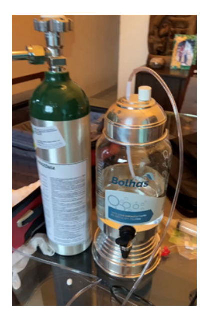
Figure 5: Ozonated water

In this process, an ozone concentration of 20 to 100\mu g/ml is used in double-distilled water bubbled in small bubbles, on average for 5 to 20 minutes, to reach a final solution concentration of 5 to 25\mu g/ml (CRISPIM et al 2019).