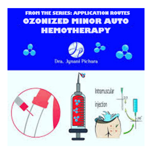
Figure 3 : Ozonized minor autohemotherapy.