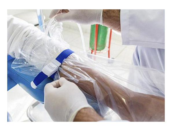
Figure 7: Bag with ozone

A transcutaneous immersion is carried out, where gaseous ozone is applied by insufflation after the area is bagged by a plastic bag, also using a low-pressure boot, built for this purpose (Rokitansky boot) or by ozone suction cup (NUNES, 2019).