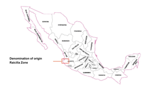
Figure 1: Map of the location of the Zone in the Mexican Republic

According to the Official Gazette of the Federation (2019), the production places authorized for the production of Raicilla by the designation of origin in the Mexican Republic are shown in Figure 1, and Figure 2 shows the territories of origin which are the following: a) Regions of the state of Jalisco: Municipalities of Atengo, Chiquilistlán, Juchitlán, Tecolotlán, Tenamaxtlán, Puerto Vallarta, Cabo Corrientes, Tomatlán, Atenguillo, Ayutla, Cuautla, Guachinango, Mascota, Mixtlán, San Sebastián del Oeste and Talpa de Allende. b) Regions of the state of Nayarit: Municipality of Bahía de Banderas (See Figures 1 and 2).