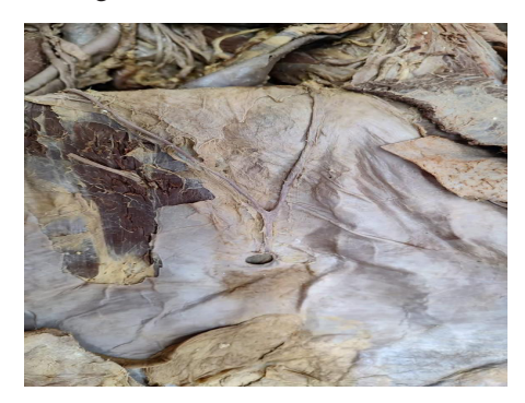
Figure 1 - View of the internal surface of the anterior abdominal wall, details of the anatomical structures present.

Commonly, the umbilical artery is the first branch of the anterior trunk of the internal iliac artery, which originates the superior vesical artery and runs anteriorly, leaving the pelvic cavity and ascending on the internal surface of the anterior abdominal wall to the navel, differently from what occurs in this case, where an obliteration occurs in the anterior region of the AU.