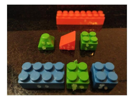
Figure 2: Finished blocks