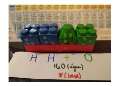
Figure 4: H2O molecule

In figures 4 and 5, two examples of molecules (H2O and CO2) are shown, showing what working with the material inside the room would be like.