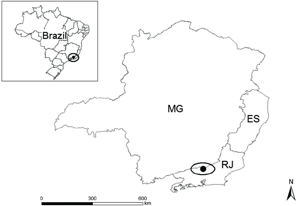
Fig. 1. Location of the capture of mosquito eggs in the local area Booded by the Simpló'cio Hydroelectric Reservoir (SHR-Simpló'cio).