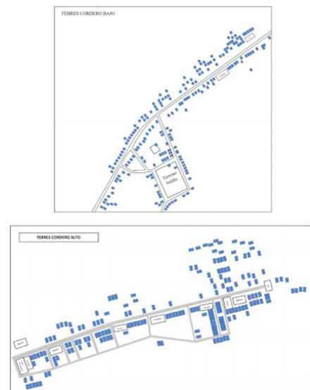
Figure 2. Map of Febres Cordero: Upper and Lower