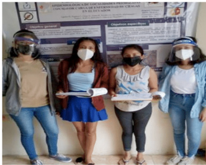
Figure 5. Volunteers from the community and the research team

by T. cruzi . For this purpose, drops of fecal material obtained by abdominal pressure were diluted on a slide with a few drops of saline solution and examined under a microscope at 400X.