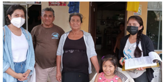
Figure 4. Field work in the community. Approach to the dwellings

Specimens were collected manually using plastic containers and tweezers, then transported to the laboratory. The specimens were captured with the help of the research team, by technicians and/or entomologists. The triatomines collected were placed in containers identified with codes (house, population center and municipality), covered with tulle cloth and fastened with rubber bands. The samples of the collected specimens were identified taking into consideration the morphological characters of each species collected. For the diagnosis of the species, the taxonomic determination was carried out according to the keys of Lent and Wygodzinsky (1979) (20). This activity was carried out at the Laboratory of Tropical Pathologies (Center of Excellence. Faculty of Medical Sciences. University of Guayaquil). The specimens that arrived alive at the laboratory were examined individually to determine if they were infected