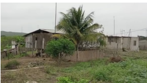
Figure 6. Typical house of the Febres Cordero community. Colonche Parish. Santa Elena-Ecuador.

The community claimed to have seen five of the vectors of Chagas disease. The most commonly identified triatomine by the inhabitants were Rhodnius ecuadoriensis inside the housing units (n=26; 76.47%) and in the peridomicile (n=11; 55.0%) followed by Triatoma infestans (n= 3; 8.82%) at home (Table 1).