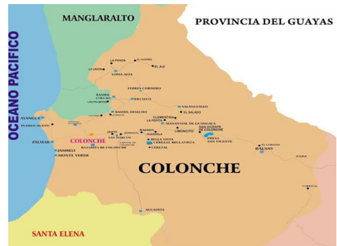
Figure 1. Map of Colonche Parish.

to the 241 families that were surveyed. Prior to the application of the survey and the approach to the households, it was conducted a two-week training period for volunteers who wished to participate in the study (face-to-face and virtual), due to the SARS-CoV-2 pandemic. The training consisted of the recognition of the vector species of Chagas disease, through the use of image primers, digital tools and active search of the vector by the community itself, with the support and guidance of the project researchers, including an entomologist, as well as the differentiation of other similar insects that could have clinical relevance.