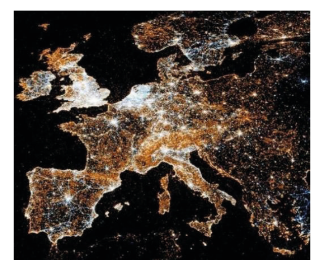
Figure 4. European Continent Night image of the planet's surface captured by the ISS released by NASA.

Finally, according to studies presented during the Planet Under Pressure event, organized by the United Nations, these indicate that in the next two decades, urban areas are expected to expand by 1.5 million square kilometers. However, this trend can be positively explored through meticulous planning of the construction of new buildings, which, if oriented and executed efficiently, such a process can contribute to mitigating wind turbulence, caused by surface roughness,