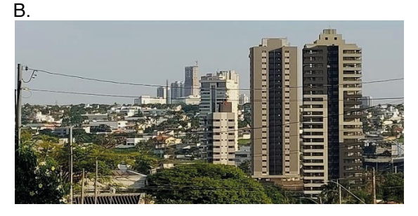
District: Morada da Colina, Uberlândia-MG

One of the main catalysts for the increase in the planet's roughness was the Industrial Revolution. This crucial period, marked by the intensification of production and demand for services, triggered a significant rural exodus to urban areas.