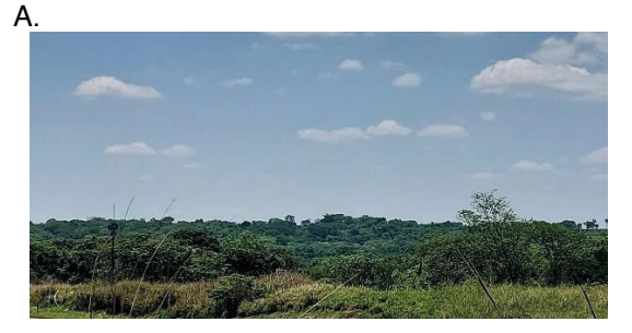
Savannah next to: Uberlândia-MG

In untouched nature, a gradual transition between biomes is observed, characterized by a smooth growth in the height of the landscapes. This phenomenon contrasts with the urban environment, where tall buildings often rise immediately next to shorter structures, as exemplified in Figure 2 with photos captured by the authors.