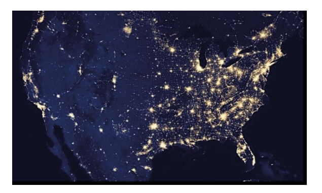
Figure 3. United States Night image of the planet's surface captured by the ISS released by NASA.

occupation of metropolitan areas, but also of the increase in roughness, creating obstacles in the circulation of winds.