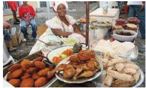
Baiana do Acarajé

year, its great culinary diversity, its natural beauty, its vast architectural heritage, its different forms of artistic expression of a corporal, musical and festive nature, among others.