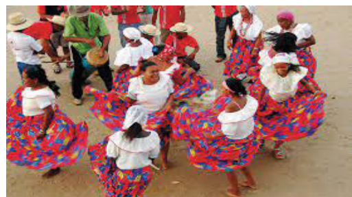
Samba de roda

Through the analysis of scholars who looked into the production of legal diplomas produced from the 1930s to the 1970s, the results were confirmed as to the little state concern regarding the tourism phenomenon, as well as, only from the 1980s onwards, the modification of this situation of lack of interest in this phenomenon is perceived.