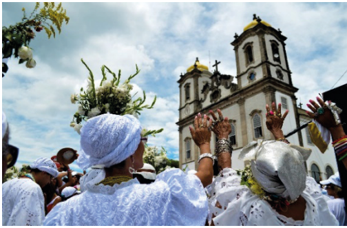
Sr. do Bonfim Feast