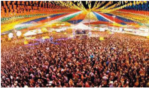
São João Feast