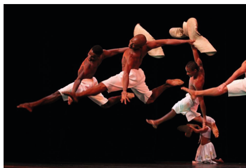
Puxada de rede