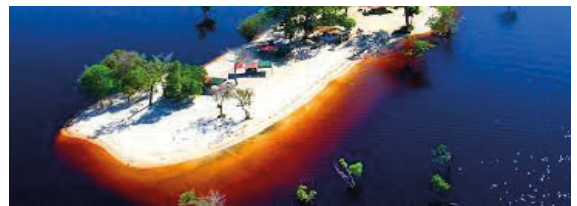
River Beaches