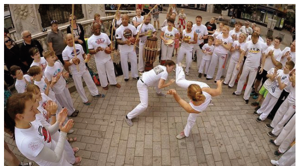
Source: Laura Aidar - Training of a Capoeira roda https://www.todamateria.com.br/capoeira/

With this conceptual understanding for the recognition of the Roda de Capoeira, the Brazilian Ministry of Culture promoted initiatives with a view to its recognition as intangible cultural heritage of Humanity by UNESCO, for all its representativeness and symbolism. This goal was achieved through the recognition of the “Roda de Capoeira” by UNESCO, at its 9th Session of the Intergovernmental Committee for the Safeguarding of Intangible Heritage held in Paris on 26/11/2014 (United Nations Brazil [UNESCO], n.d.) ( https://brasil.un.org/pt-br/152296-roda-de-capoeira-patrimonio-cultural-imaterial-da-humanidade-unesco ).