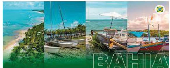
Bahia Beaches