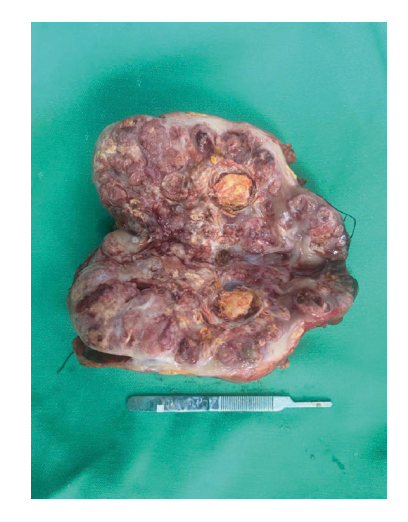
( Figure 2 : Right kidney on a scalpel handle comparison scale.

Pathological staging (AJCC 8th edition)-pT3a.