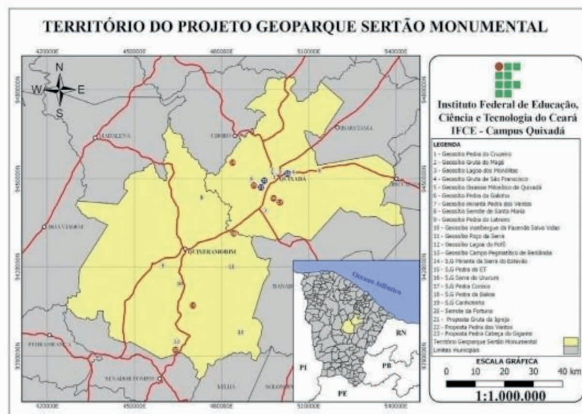
FIGURE 1 – Location Map of "Geopark Sertão Monumental", Ceará.

limits of "Geopark Sertão Monumental" area, with the aim of investigating the possibility of including two new geosites in the list.