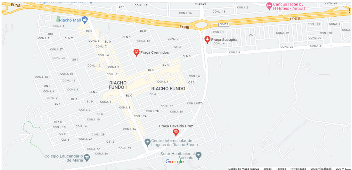
Figure 2 - Image of the standard map of the city of Riacho Fundo I