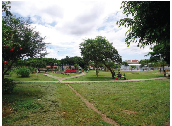
Figure 3 - Cremildos Square

a children’s playground and a pergola with concrete benches (Figure 5).