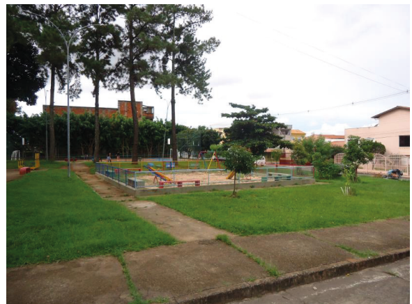
Figure 4 - The square: “Praça Sucupira”