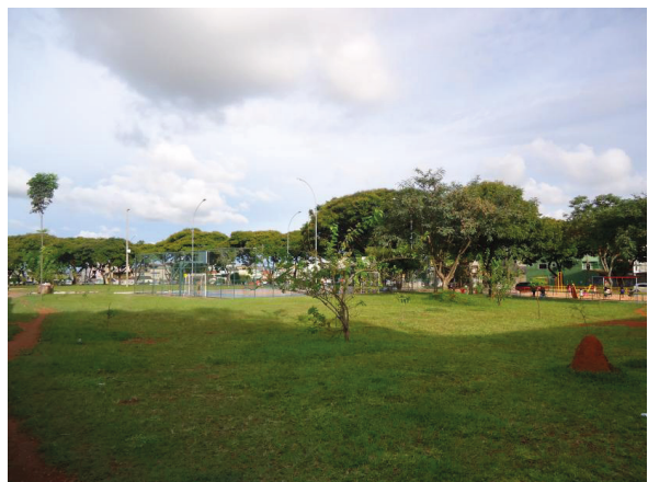
Figure 5 - Osvaldo Cruz Square