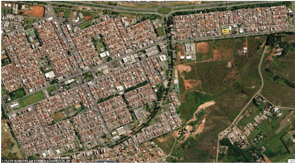
Figure 1 - Satellite image of the city of Riacho Fundo I