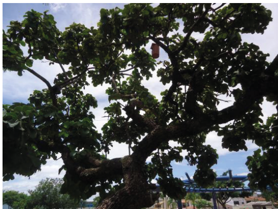
Figure 6 - Bird drinking fountain in a pequi tree

However, water fountains to attract birds were seen in some trees in ``Praça Cremildos`` (Figure 3), and it can be inferred that the surrounding community somehow wants to establish some interaction in that environment.