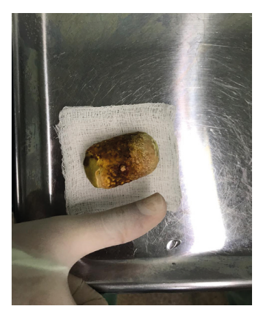
Figure 4. Calculation approximately 5 cm.

3. Fontes JDS, Farias IDO, Garcia HJP, De Souza MCA, Maia LMDO. ABDOME AGUDO OBSTRUTIVO POR ÍLEO BILIAR :RELATO DE CASO. Rev Saúde. 2019 Jun 15;10(01):32–7.