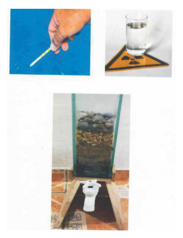
ANNEX 03: Results