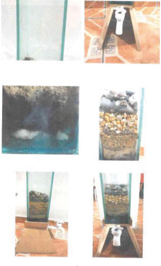
ANNEX 02: Filter Construction