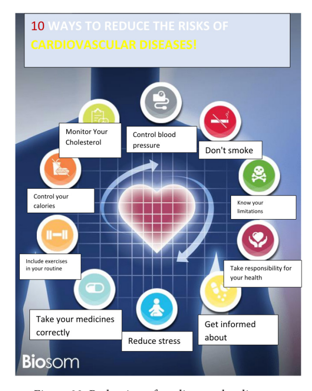
Figure 03: Reduction of cardiovascular diseases.

What can be observed is that cardiovas cular diseases have increased, both in Brazil, which according to the Ministry of Health (2017) more than 300,000 people suffer heart attacks and 30% of cases are fatal, and in the world, about 17 million have been victims of coronary heart disease including heart attacks, so we must understand that there is a need for greater awareness regarding the risk of heart disease than according to WHO facts and data