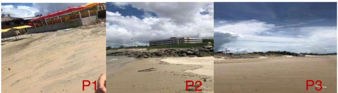
Figure 3. BeachAreFrames(P1, P2, P3).