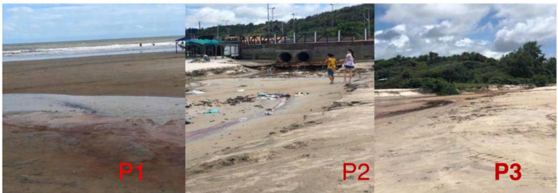
Figure 2. Beach of Araçagy (P1, P2, P3).