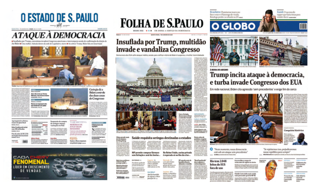
Figure 3 - Newspapers from Brazil Source - VerCapas (2021).

Source - Author based on the covers of the analyzed newspapers (2021)