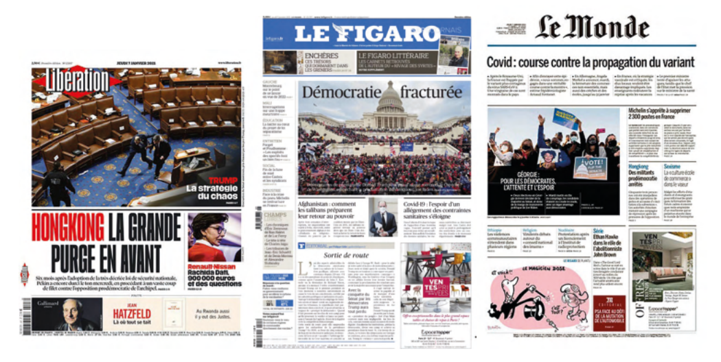
Figure 6 - Newspapers from France