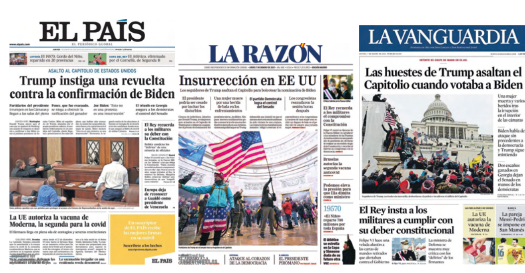
Figure 4 - Newspapers from Spain

Figure 3 - Newspapers from Brazil