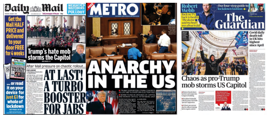
Figura 9 - Newspapers from the UK