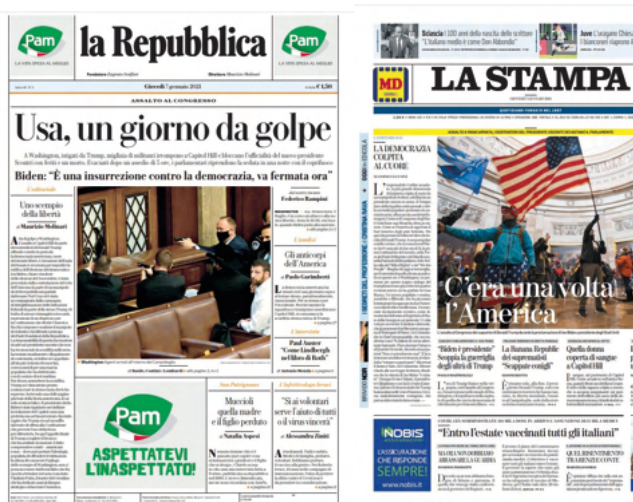
Figure 7 - Newspapers from Italy