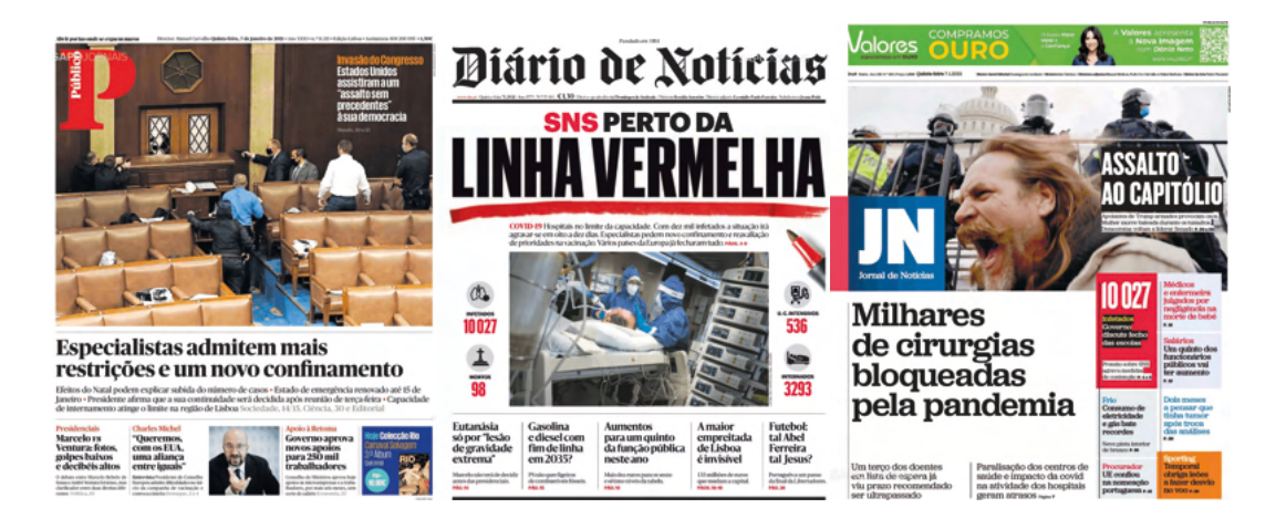
Figure 8 - Newspapers from Portugal