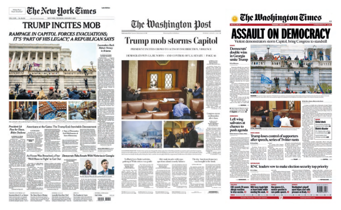
Figure 5 - Newspapers from the USA