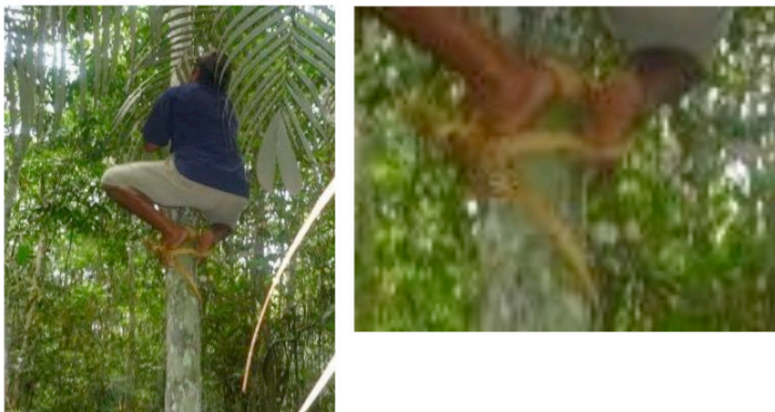
Figure 1. Removal of açaí bunches with the use of “ peconha ”. Detail of the “ peconha ”.

Climbing the palm trees using only the pecuniary points some risks to the extractivist worker. Although the pecuni is made of vegetable fiber (Figure 1) that has a reasonable resistance able to support the weight of the climber, it does not guarantee the safety of the same, as it is possible these fibers to break and cause serious accidents.