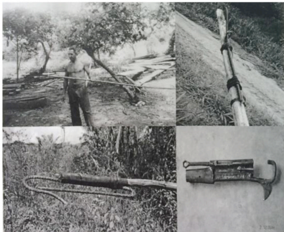
Figure 2. Açaí bunch collector made of wood with its variations in the cutting system.