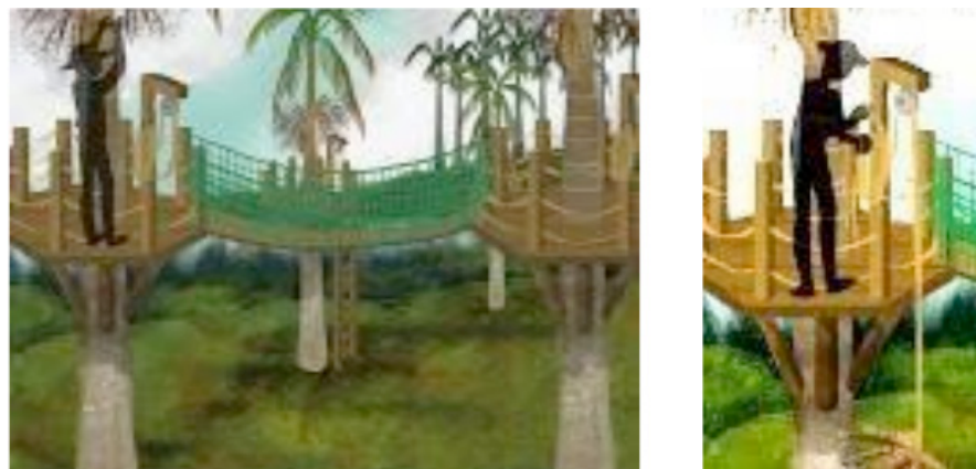
Figure 5. Canopy walking with a system of sheaves as proposal for the harvest of the acai.

However, our proposal sought another way of approaching the issue. We did not present the development of equipment for harvesting the açaí bunches, but rather a proposal to avoid climbing the açaí tree and to promote the safe collection: canopy walking. Canopy walking (Figure 5) consists of ladder, walkways with protective net and platforms. In the platforms will be inserted a system of pulleys fixed in the bunches to descend them to the ground.