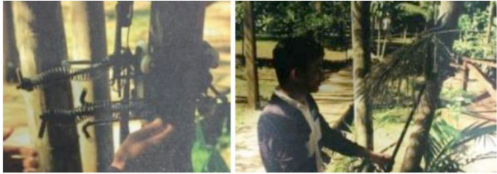
Figure 3. Açaí “picker” prototype.